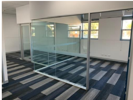
Student Services Office

During term 2 the front office and student services areas have been renovated, with student services being entirely relocated to a different part of the building. Part of the renovations mean that students who arrive late will enter through what used to be the Student Services courtyard. Visitors will continue to be served at the previous front office counter, and parents/carers can use that counter to pay for excursions or deal with administrative issues. The