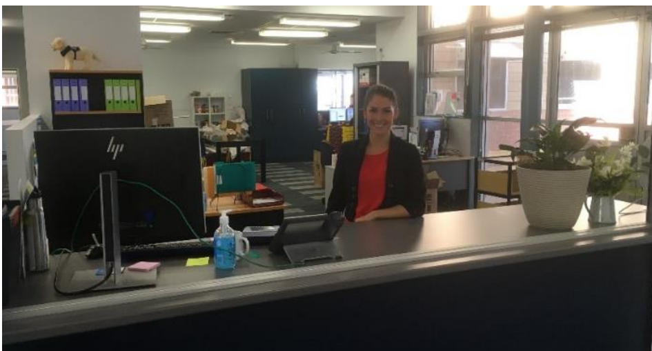
New Student Reception Counter

Student Reception will be where students sign in and out, pay for excursions and pick up or drop off forms. Students will be able to access Student Services via the internal courtyard (called 'The Marketplace'), rather than having to go around to the front of the building. We will be organising new signage for the front of the school.