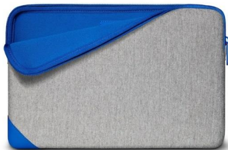
Example of a soft case suitable for chromebooks