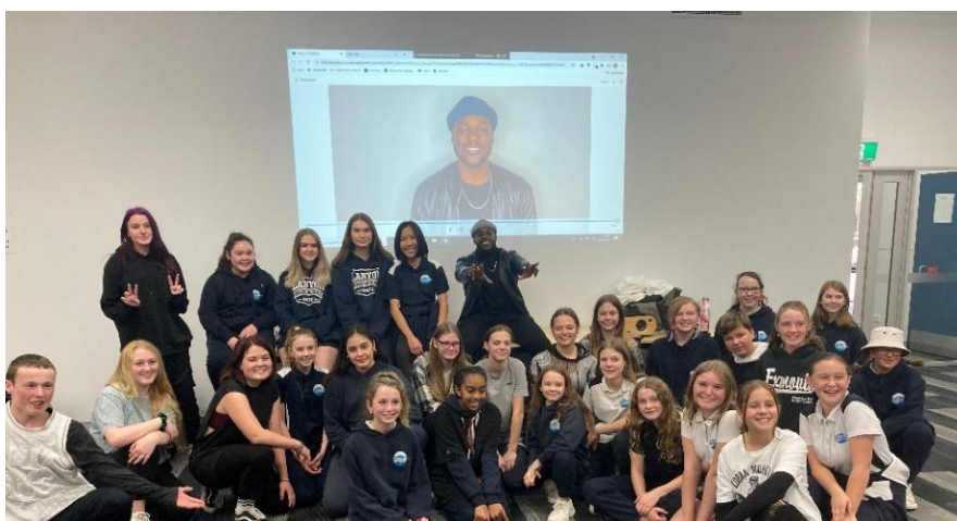
Our Dance Nation students had a surprise visit from Timomatic.